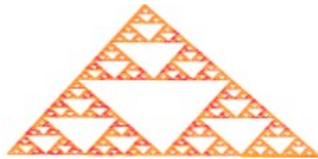
Figure 1 Sierpinski Triangle

The Sierpinski triangle, shown below as Figure 1, is an example of a strictly self-similar fractal. You will note that the triangle appears to be formed of three similar triangles, each of which in turn appears to be formed of three smaller similar triangles, etc. If you magnify smaller portions of the triangle, the basic 'shape' of the image will remain constant.